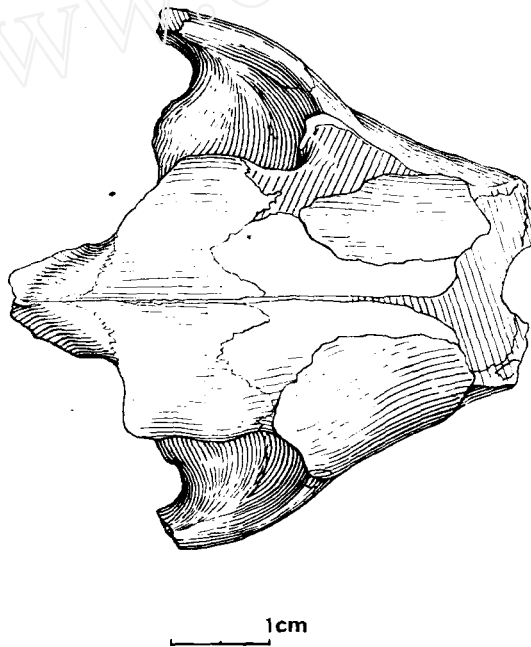
图 1 潜山丰齿兽头骨 (V8304), 顶面观

Fig. 1 The skull of Plethorodon chienshanensis (V8304), dorsal view