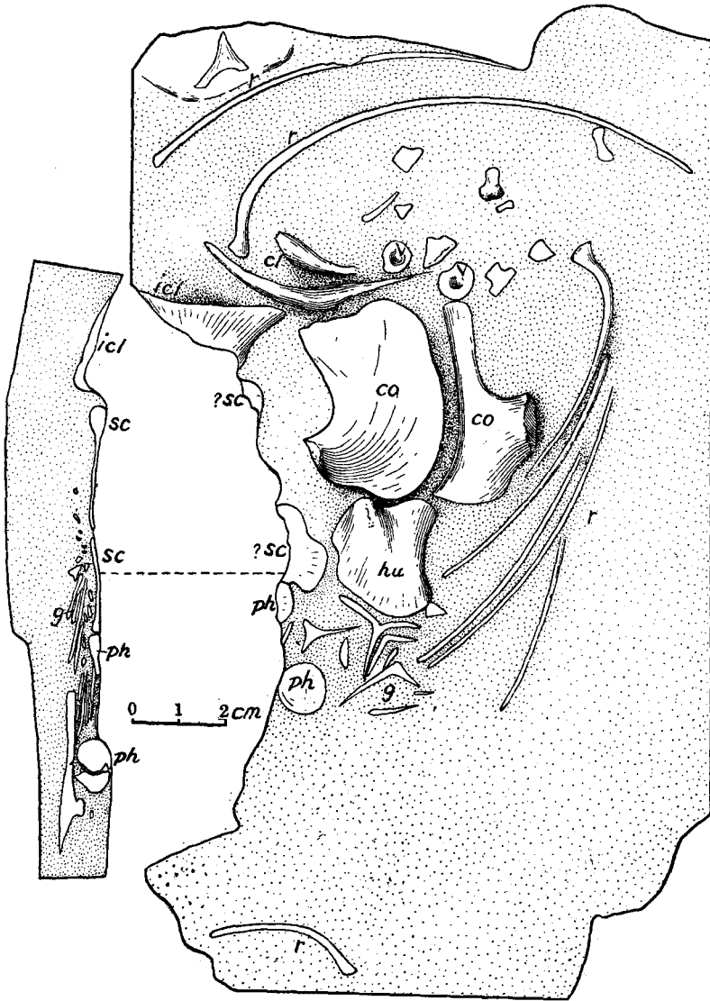
图1 茅台混鱼龙, 正型, 1960年文的图版I重绘。详看正文。左侧表示原标本左侧断裂处的一些骨。2/3 原大。

Mixosaurus maotaiensis sp. nov. Type specimen drawing from the original slab published in 1960 Plate I. Abbreviations and details see text, the part showing on the left of the figure is the breakage with bones of the left side of the slab. 2/3 nat. size.