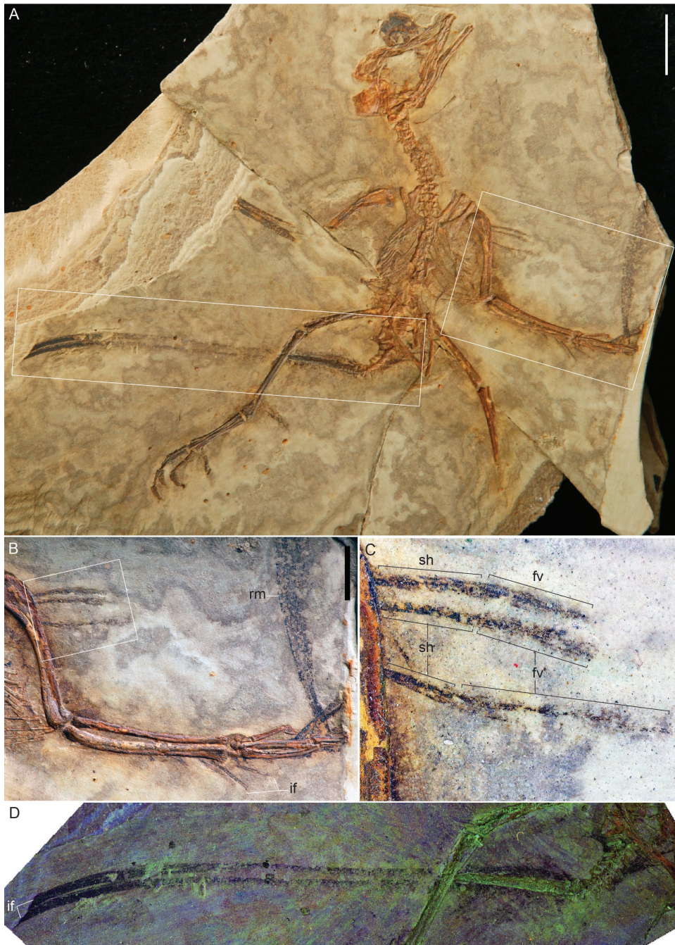
Fig. 5 Juvenile enantiornithine IVPP V 15564 preserving probable immature feathers

A. slab A; B. left forelimb (enlarged from boxed region indicated in A);