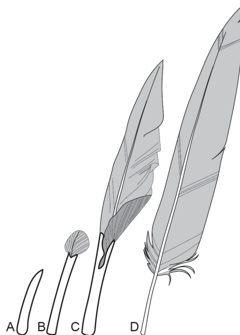
Fig. 2 Illustration of the stages in feather development

Recently, integumentary data from the Jehol Lagerstätte is being supplemented by skeletal specimens with associated soft tissue three-dimensionally preserved in Cenomanian