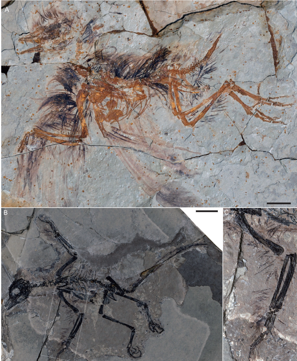
Fig. 6 Juvenile enantiornithines preserving possible immature feathers

solid appearance along the proximal two-thirds of their length. These tail feathers are poorly preserved but barbs appear to be visible along the distal third. The unusual preservation and curved appearance of these RDFs may suggest they are immature.