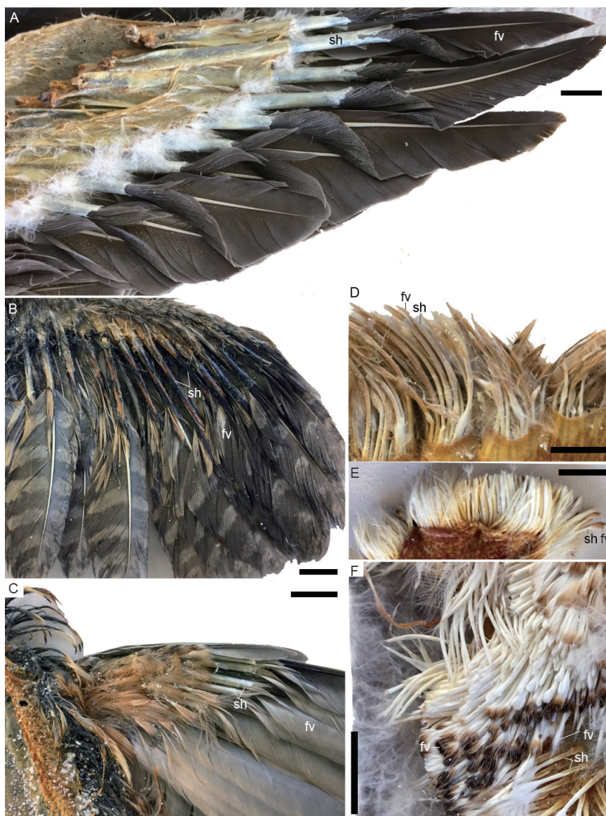
Fig. 1 Immature feathers in juvenile neornithines

Feather emergence has not been convincingly documented in any avian specimen from the rich Jehol Biota. However, immature feathers have been proposed to be present