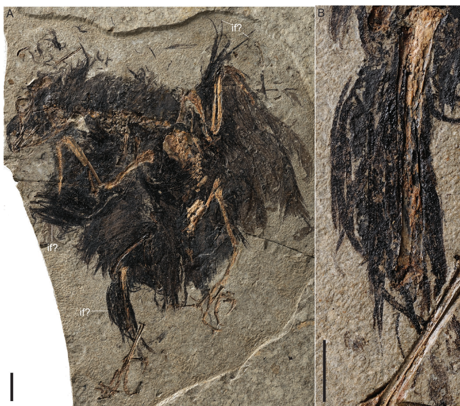
Fig. 7 Unusual feathers in Cruralispennia IVPP V 21711 A. photograph of the full slab; B. close up of the unusual feathers on the tibiotarsus Scale bar in A equals 1 cm; scale bar in B equals 5 mm. Abbreviations see Fig. 4