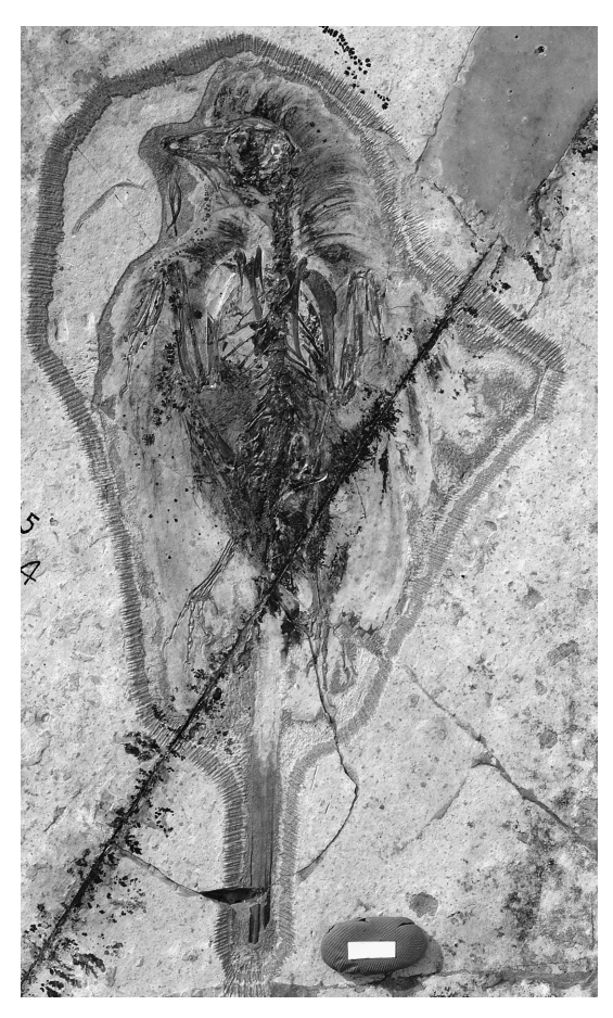
Protopteryx , the most primitive known enantiornithine bird, collected from the Early Cretaceous of Hebei Province, northern China.

The group name refers to this difference: the Greek word "enanti" means directly opposite, and therefore Enantiornithes means "opposite birds." Enantiornithes is a natural (monophyletic) group, which is united by the shared possession of several unique features, including the characteristic contact between the scapula and coracoid, the distal (lower) end of the third metacarpal of the hand extending markedly past that of the second metacarpal, and a furcula (wishbone) with a long process (hypocleidium) that projects forward.