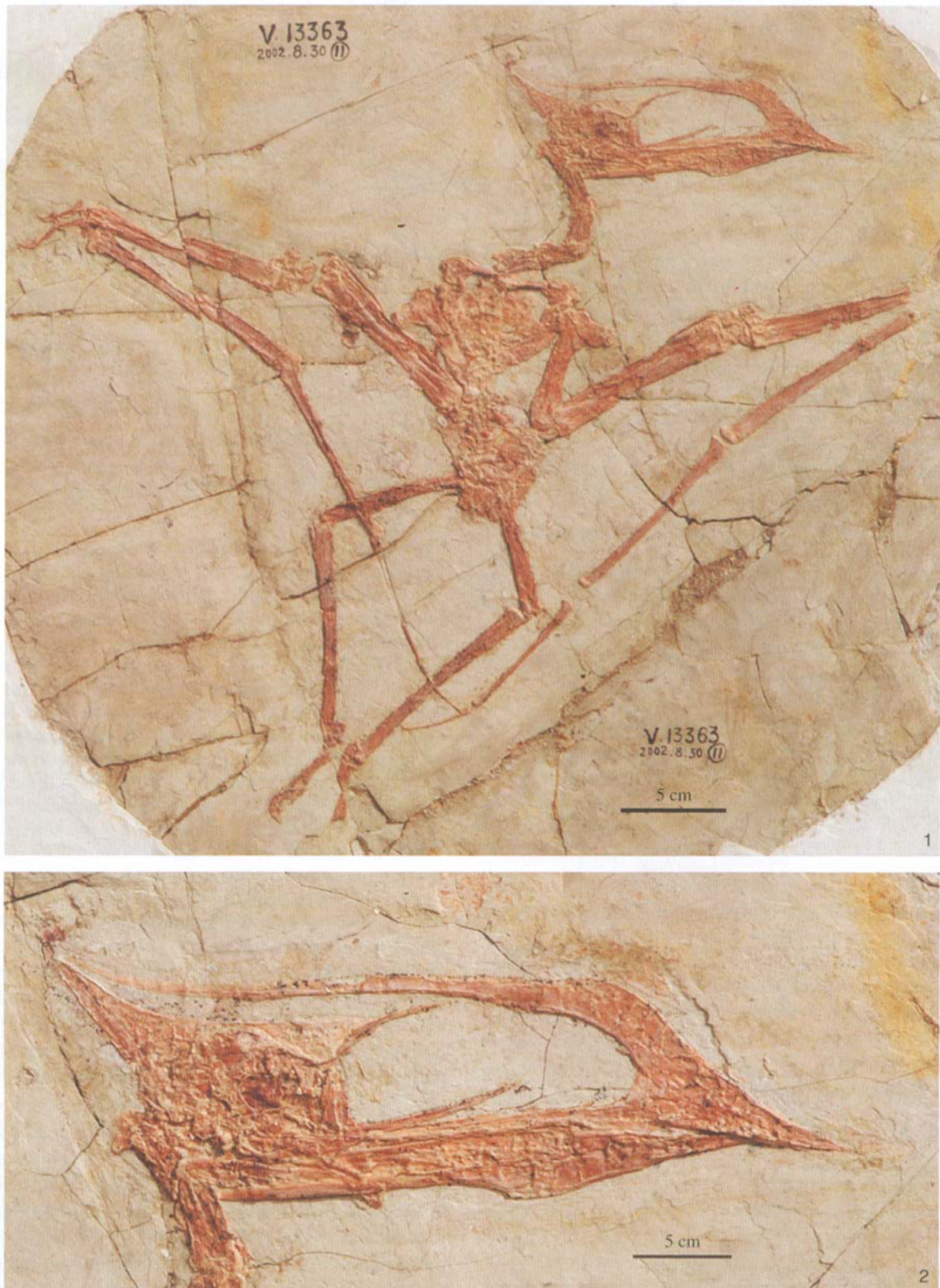
Fig. 2. Holotype Sinopterus dongi gen. et sp. nov. (IVPP V 13363). 1, Skeleton; 2, skull.