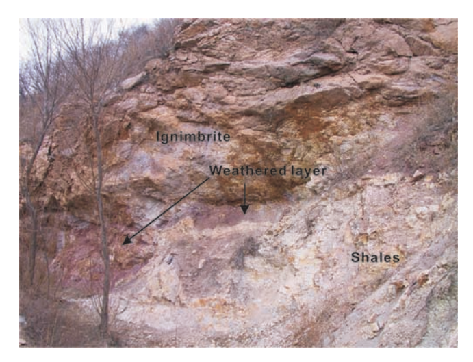
Figure 2. The direct contact between the weathered layer of the ignimbrite and the Daohugou shales near the Daohugou village (119.22°E, 41.32°N). The presence of the weathered layer of the ignimbrite indicates that the shales were deposited later than the ignimbrite, thus the section shows a reversed sequence, i.e., the upper ignimbrite is older than the lower shales.

[12] <sup>40</sup>Ar/<sup>39</sup>Ar step heating of the K-feldspar from the ignimbrite at the Daohugou locality gives an isochron age of 159.8 \pm 0.8 Ma, corresponding to the latest Middle Jurassic (Callovian) or the earliest Late Jurassic (Oxfordian). Considering the vastly different isotope system behavior, this result is more or less concordant with the SHRIMP U-Pb zircon age (165.5 \pm 1.5 \text{ Ma}, 1\sigma, \text{MSWD} = 0.75) for the andesite reported by Chen and Zhang [2004]. They argued that such a dating result indicates the Daohugou deposit, which was presumed to be overlaid by the volcanic rock, must be older than 165 Ma, thus lends further support to its referral to the Middle Jurassic (Bathonian). However, the field examination of the relationship between the ignimbrite and deposits has resulted in a completely different conclusion about the age of the Daohugou Bed. The direct contact between the ignimbrite and the Daohugou sediments near the Daohugou village (119.22°E, 41.32°N) shows no baking of the sediments near the volcanic rocks,