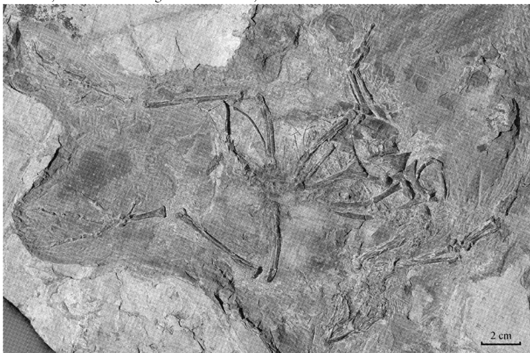
Fig. 3. Yixianornis grabau gen. et sp. nov., holotype (V12631).

Forelimbs. The forelimb is as long as the hindlimb (table 1). The manus is slightly longer than the ulna. The deltoid crest of the humerus is well developed and more than 1/3 the length of the humerus; the humeral head is large and elliptical. The ratio of the ulna to radius width is 1.5. The ulna has a semicircular dorsal condyle at the distal end. The ulnare has a distinctive metacarpal incision. The radiale is semicircular and slightly shorter than the ulnare. The carpometacarpus is fused at the proximal end; the carpal trochlea is large. Metacarpal I is short and unfused with the carpometacarpus. Metacarpals II and III are straight and of equal length; they are probably only fused at the proximal end. Metacarpal III is extremely slender; it is less than 1/3 the width of metacarpal II. Digit I is slender, its ungual is slightly longer than that of digit II. The first phalanx of digit II is expanded antero-posteriorly, the second phalanx is slender, and the ungual is small. Digit III only comprises one phalanx, which is small and tightly attached to the posterior margin of the first phalanx of digit II.