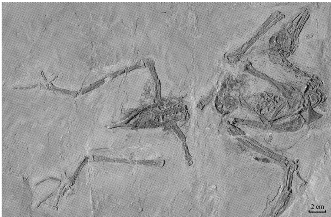
Fig. 1. Yanornis martini gen. et sp. nov., holotype (V12558).

Diagnosis. Dentary straight, about 2/3 the length of skull, with about 20 teeth. Cervicals long, heterocoelous. Synsacrum composed of 9 sacrals. Pygostyle short and less than 1/3 the length of tarsometatarsus. Sternum with a pair of posterior fenestra; distal end of the lateral process semicircular. Ratio of forelimb to hindlimb length about 1.1. Manus shorter than ulna and radius. Tarsometatarsus completely fused. Ratio of third pedal digit to tarsometatarsus length 1.1. Proximal pedal phalanges longer and more robust than distal ones.