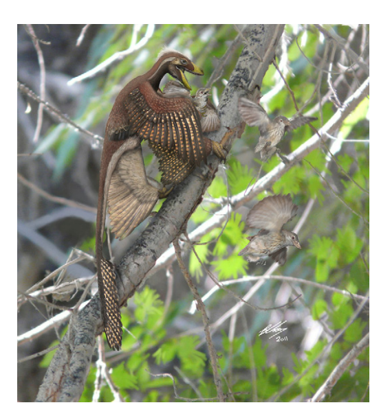
Fig. 3. Reconstruction of the life habits of M. gui.

Unlike other birds known from the Jehol, all known enantiornithines possess pedal morphologies suggesting they were adapted for arboreal environments rather than for foraging on the ground or in aquatic environments (31, 32). This understanding is supported by pedal proportions, which have been shown in modern birds to be indicative of ecology (33 34), as well as in the morphology of the foot, which is better adapted for perching than walking, with large recurved claws and a hallux that is positioned low on the tarsometatarsus. Although digit III cannot be measured in this specimen (nor can digit IV completely), the penultimate phalanx in digits II and IV are longer than the proximal phalanges, consistent with arboreal habitats