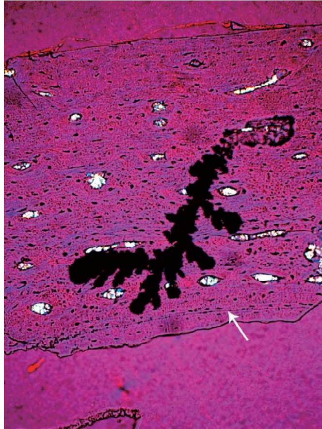
Fig. 2 Histological section from the femoral shaft of IVPP V 10597

IVPP V 10597 is small for a Late Cretaceous troodontid, indicating that this specimen represents a juvenile and/or simply belongs to a species with small adult body size. In order to assess the ontogenetic status of V 10597, we took a thin section from the mid-shaft of the femur, where the diameter measures 5.40 mm (Fig. 2). This transverse section shows a very thin compacta (0.48 mm thick) surrounding an exceptionally large central medullary cavity (4.45 mm in diameter), attesting to the occurrence of substantial periosteal expansion. The cortex is fibrolamellar bone with predominantly longitudinal vascular canals. The degree of vascularization is low, and only primary osteons can be observed in the thin section. One line of arrested growth (LAG) is present in the inner region of the compacta. The bone tissue immediately preceding the LAG was deposited more slowly than the tissue beyond the LAG. Evidence for this is the lower density, smaller size, and somewhat more flattened morphology of the osteocyte lacunae in the tissue preceding the LAG, as well as the higher degree of organization of the bone apatite crystals. This tissue together with the LAG is best interpreted as an annulus recording a marked deceleration in growth, presumably representing the end of a yearly growth cycle. There is no external fundamental system (EFS) of closely packed peripheral growth lines.